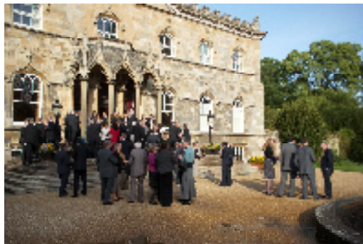
The President's Reception at Bishopthorpe Palace